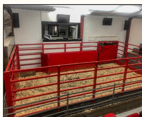
CUSTOM PIG PEN 11' X 23'